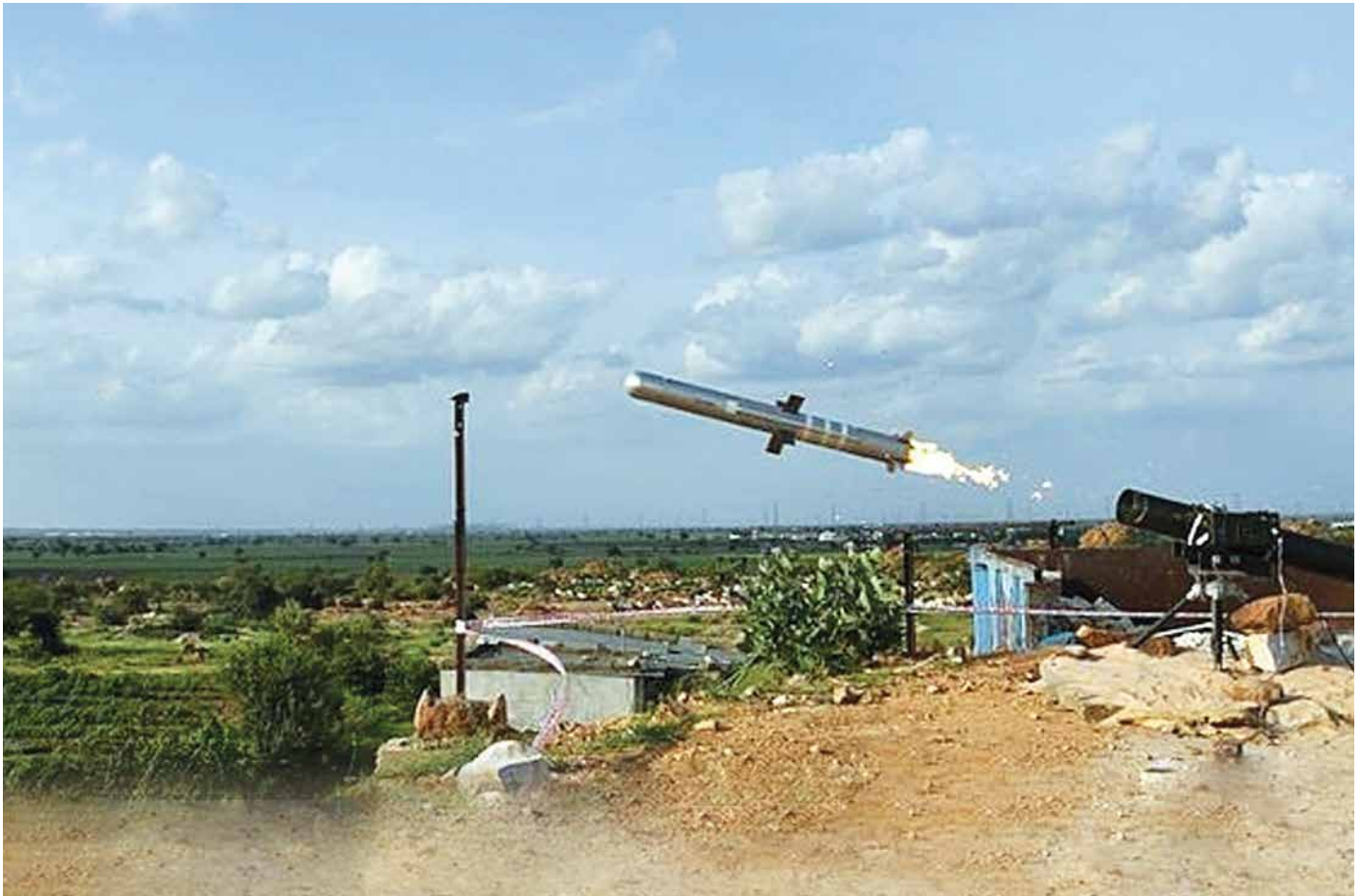
Anti-tank Guided Missile Dhruvastra

Extreme precautionary measures such as social distancing, sanitization of all facilities, use of masks and sanitizers, shield and Personal Protective Suits were taken during the testing.