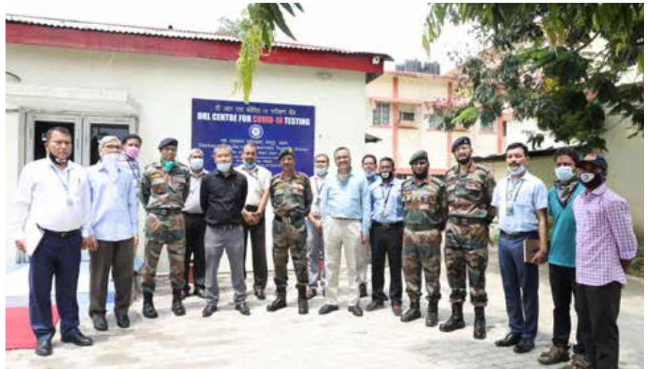
Maj Gen SC Mohanty, CoS, HQ 4 Corps at DRL Centre for COVID-19 Testing