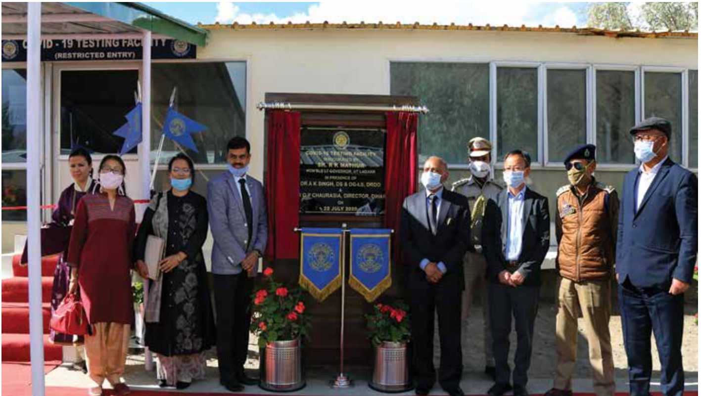
Inauguration of Covid Testing Lab at DIHAR Leh

DIHAR is one of the life sciences laboratories of DRDO working on cold arid agro-animal technologies. The laboratory is screening and identifying the medicinal and aromatic plants to exploit them for use for defence purposes and also on greenhouse technologies for high altitude and cold desert areas.