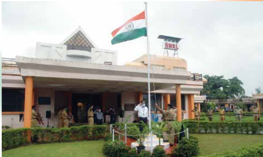
Flag hoisting on Independence Day at NMRL