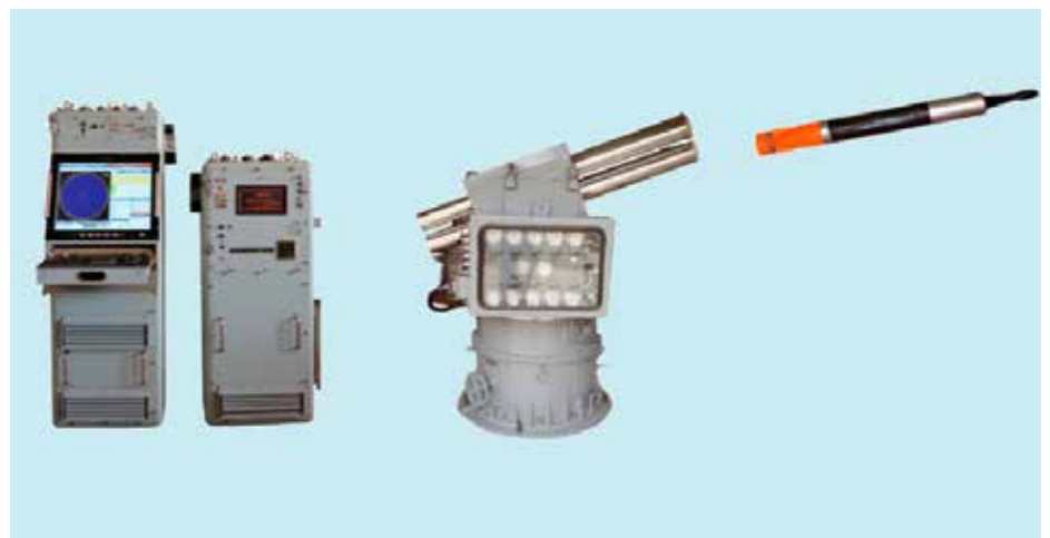
Maareech ATDS (L to R): Fire Control System, Decoy and Expendable Decoy

detection and decoying capabilities superior to that of global systems. Also, being totally indigenous, continuous support of DRDO and Indian industry is available for up gradation of capabilities based on new requirements arising out of tactical missions.