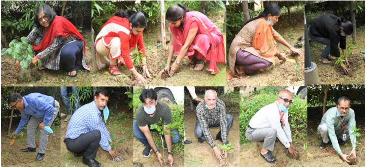
DESIDOCians planting saplings