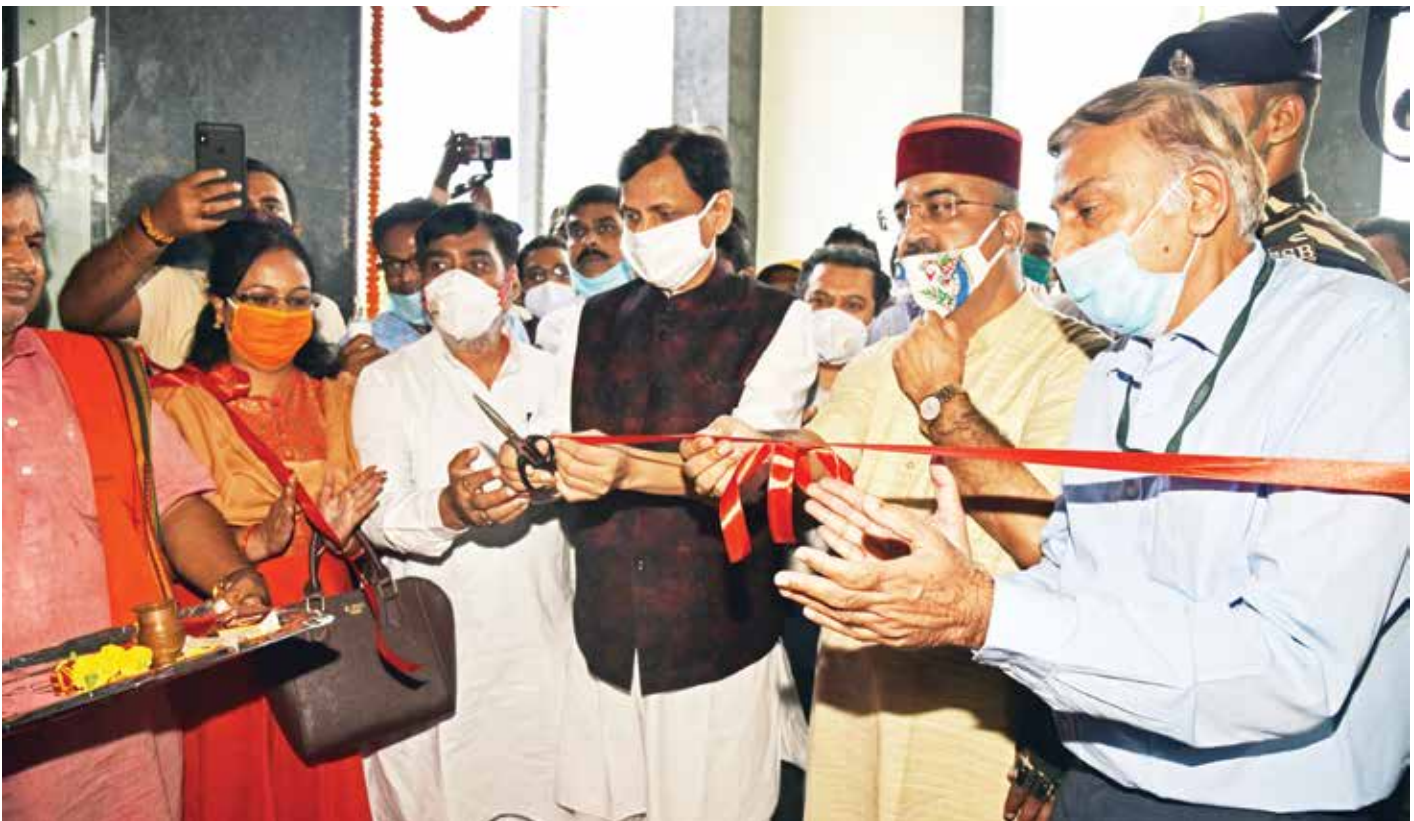
Shri Nityanand Rai, Hon'ble Union Minister of State for Home Affairs inaugurating DRDO's 500-bed Covid Hospital in Bihta, Bihar

Doctors, nurses, and other supporting medical staff, etc., for the hospital have been arranged by the Directorate General Armed Forces Medical Services (DGAFMS). Bihar Government will provide free of cost facilities such as 2 lakh lt of water per day, 6 MVA electric supply and security arrangements for the hospital.