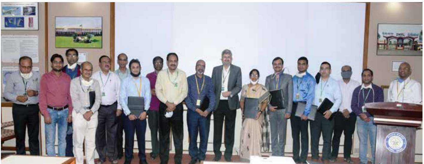
DG (NSM), DRDO and Director DMRL with representatives of Transferee Firms

DMRL has indigenously developed the technology for manufacturing