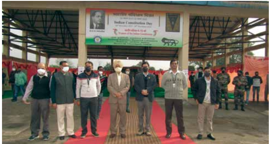
Director TBRL along with Senior Scientists at the entry of Exhibition Hall.

An exhibition hall was established in TBRL Ranges and banners, posters and standees were displayed to create awareness about the constitutional values, fundamental duties and