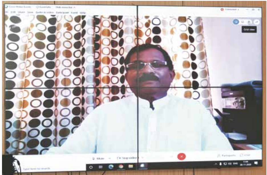
Raksha Rajya Mantri, Shri Shripad Naik delivering a talk on Constitutional Values and Fundamental Principles of Indian Constitution through video conferencing