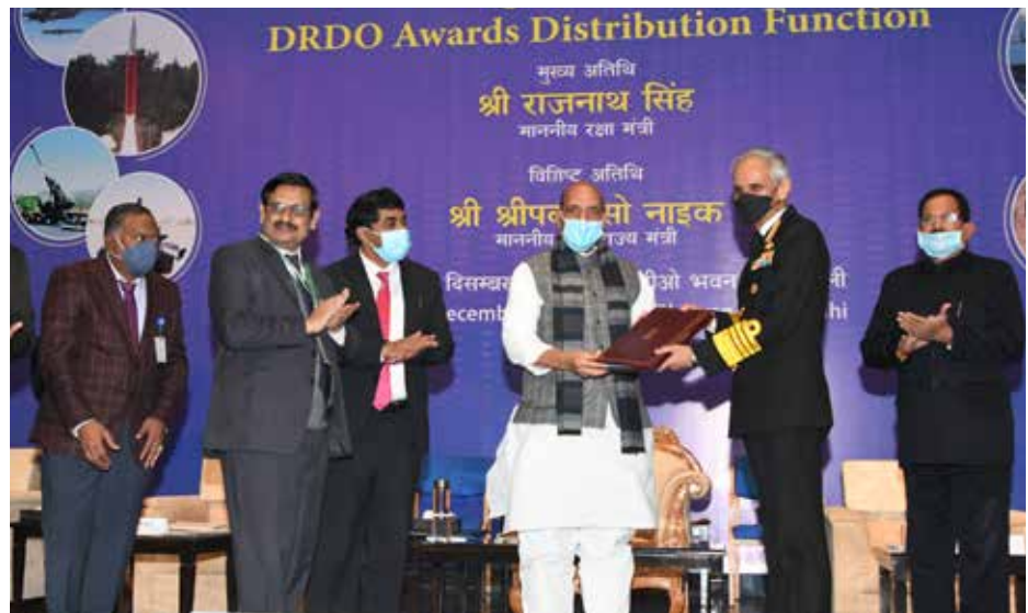
Hon'ble RM handing over IMSAS to CNS Admiral Karambir Singh

The Astra Mk-I is the first Beyond Visual Range (BVR) Missile, which can be launched from Sukhoi-30, LCA Tejas, Mig-29 and Mig-29K. Very few countries have the