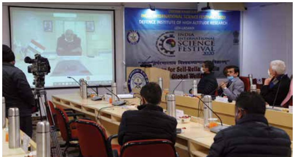
Inaugural Session of the curtain raiser event of IISF-2020

The IISF 2020 is the sixth of the series, organized continuously since