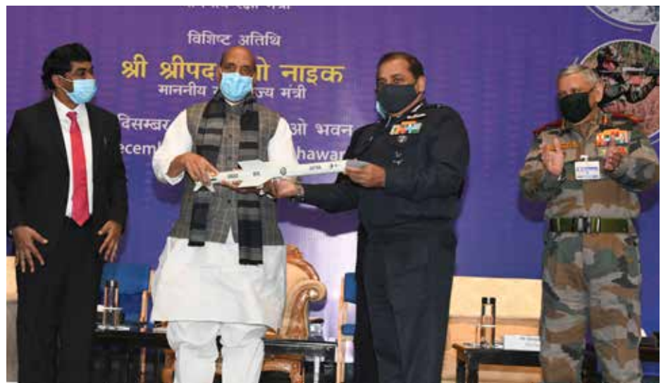
Hon'ble RM handing over Astra Mk-I to ACM Rakesh Kumar Singh Bhadauria

electronic surveillance system successfully designed and developed by Instruments Research & Development Establishment (IRDE), Dehradun. The system has been deployed at Ladakh border area for day and night surveillance. The system facilitates monitoring and surveillance by automatically detecting the intrusions in harsh high