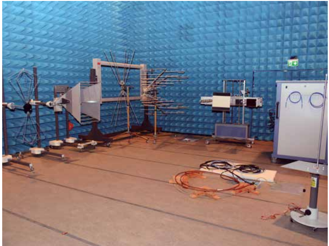
RF shielded Semi-Anechoic Chamber of the EMI/EMC Test Facility

A n EMI/EMC Test Facility has been established at Defence Electronics Application Laboratory (DEAL), Dehradun to fulfil the testing requirement as per MIL-STD 461E and F except RS105 Test. As all these tests are similar in MIL-STD 461G, hence, it also complies for MIL-STD 461G except for test CS 117 (lightning induced transients). This facility has enhanced capability of ESD test up to 30 kV (Contact and Air Discharge) along with RS 103 test (electric field up to 200 V/m). The Test facility has RF shielded Semi-Anechoic Chamber (SAC) of working volume 11 m x 7.5 m x 6.0 m, fully automated EMI/EMC Test instrumentation and accessories for EUT of size 1 x 1 x 1 m 3 .