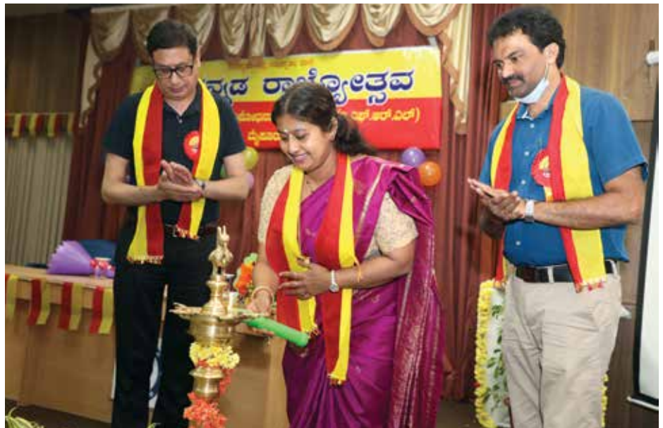
Inaugural of Kannada Rajyotsava at DFRL