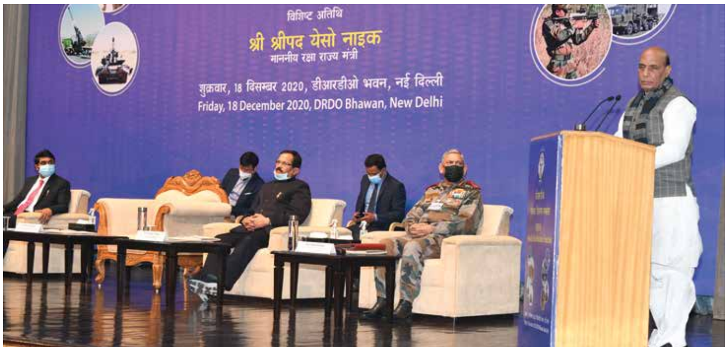
RM Rajnath Singh addressing the DRDO Awardees