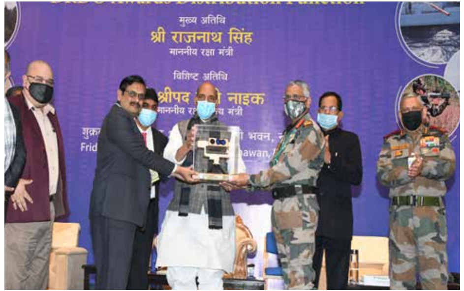
Hon'ble RM handing over Border Surveillance System to CoAS General MM Naravane

Speaking on the occasion Secretary, DDR&D and Chairman, DRDO Dr G Satheesh Reddy said that the DRDO is committed to the development of advanced systems