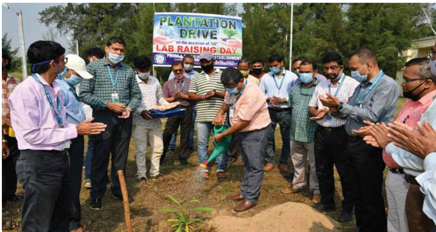
Plantation drive at ITR

To fulfil corporate social responsibility and In order to contain the outbreak of COVID-19, masks and sanitizers were distributed to the orphanages, old age homes and blind schools in Balasore town. Respect and gratitude were offered to all the COVID warriors by offering flowers and lighting lamps.