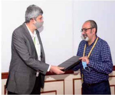
Transfer of silver nano particle formation process to M/s Vertex Enterprises

of Ag NPs in a polymer matrix, which can be used to prepare films, sheets or laminates on fabrics. The process involves coating of silver salt on polymer granules and their conversion to Ag NPs during melting of the polymer granules. The polymer matrix itself acts as a stabilizer and controls the particle size. This technology can be used in various applications such as Personal Protective Equipment (PPE) used by