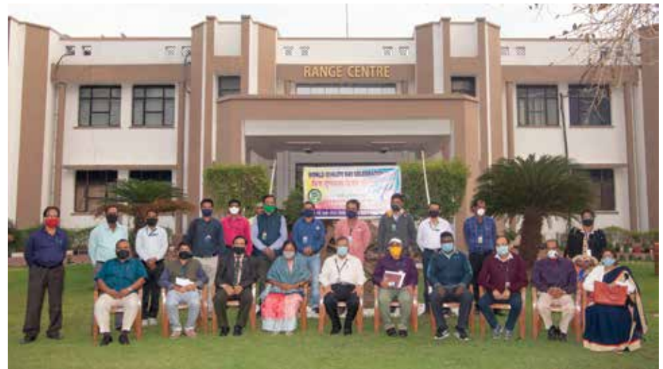
World Quality Day celebration at ITR

in Test firing of missiles scenario justifying the vision and Mission of ITR and elaborated the theme 'Creating Customer Value'. More than 100 Officers and Staff attended the