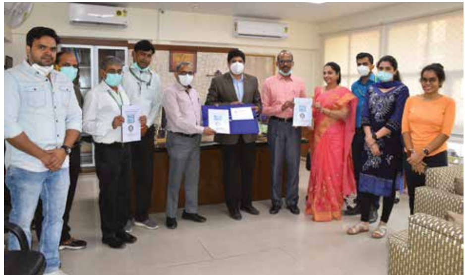
Handing over the LAToT documents to representatives of M/s Sarvotham Care Ltd

Q-DIP is a performance enhancer and immunity booster especially developed to prevent high altitude sickness after extensive preclinical studies. It improves operational