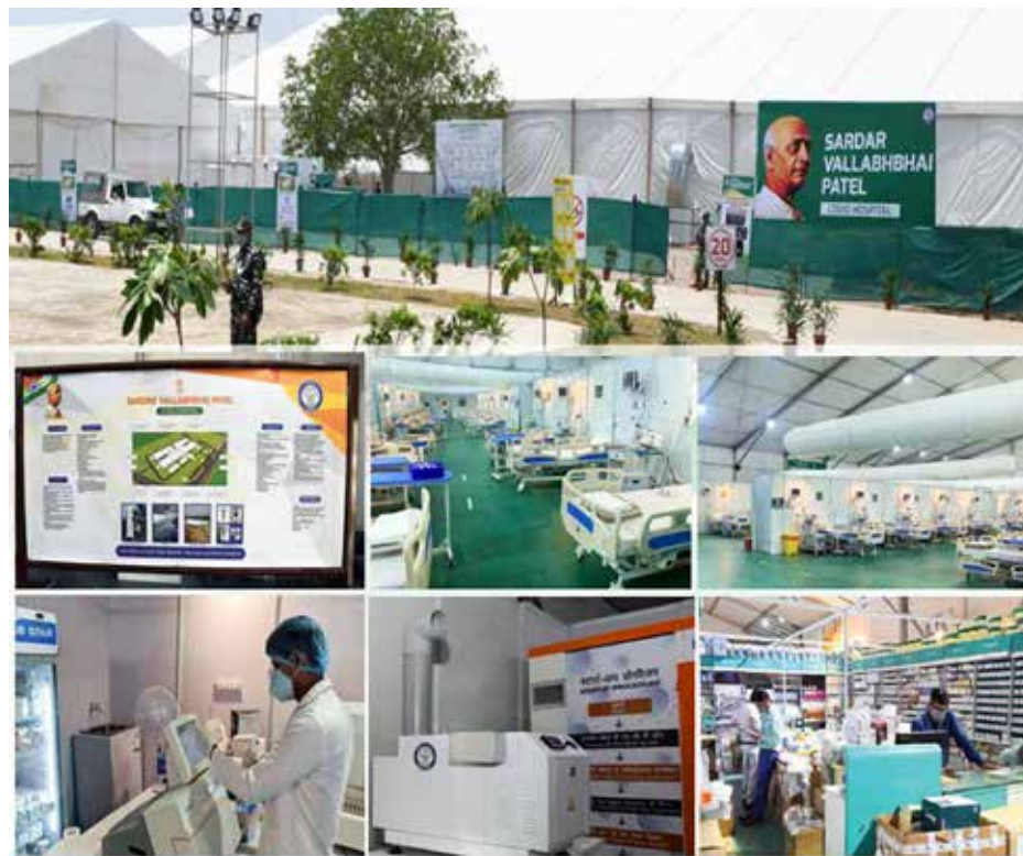
DRDO COVID Hospital in Delhi

This is the biggest facility in Delhi in terms of ICUs for COVID-19