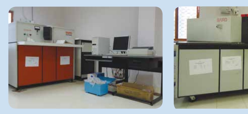
Optical Emission Spectrometer (DV-4)