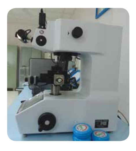
Digital Micro Hardness Tester