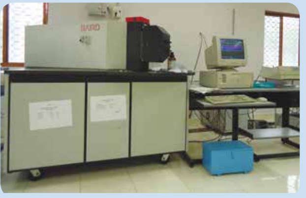
Optical Emission Spectrometer (DV-6)