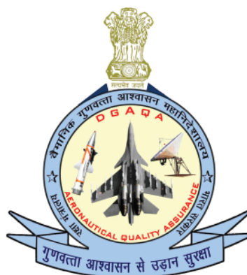
Directorate General of Aeronautical Quality Assurance