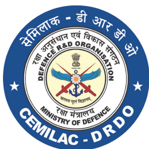
Centre for Military Airworthiness and Certification