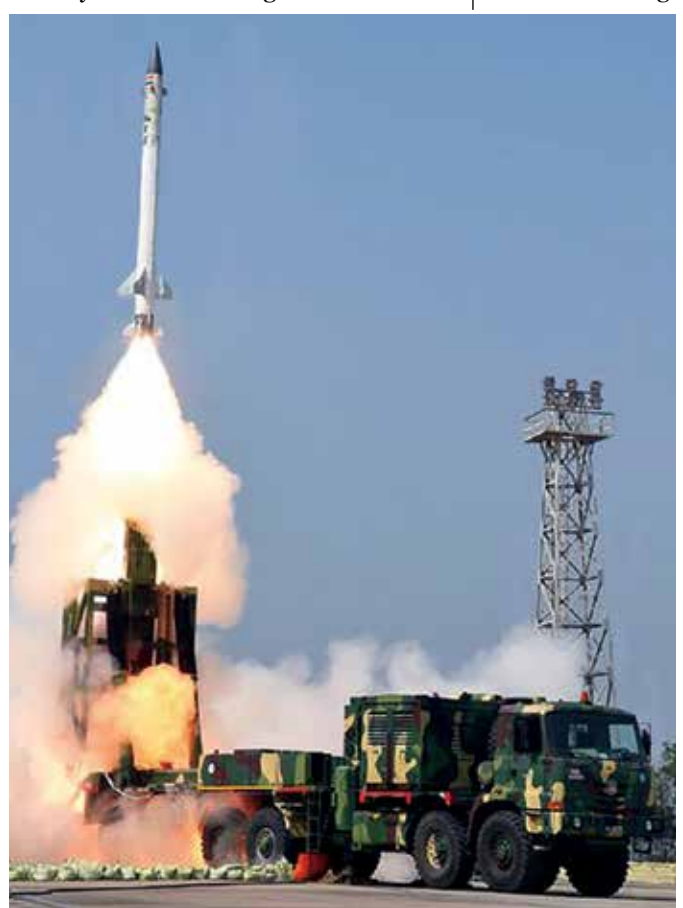
AAD Endo-Atmospheric Interceptor Missile

monitored the launch operation along with other senior officials.