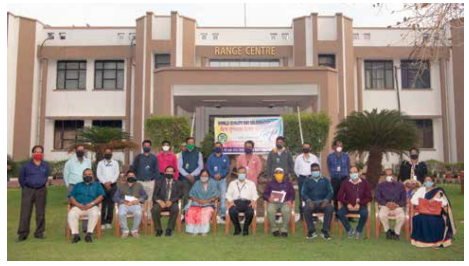
World Quality Day celebration at ITR

in Test firing of missiles scenario justifying the vision and Mission of ITR and elaborated the theme 'Creating Customer Value'. More than 100 Officers and Staff attended the