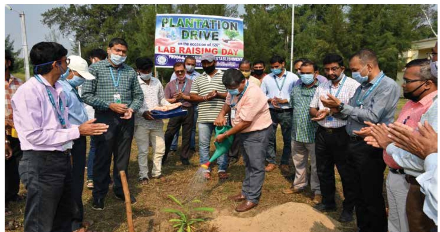
Plantation drive at PXE

To fulfil corporate social responsibility and In order to contain the outbreak of COVID-19, masks and sanitizers were distributed to the orphanages, old age homes and blind schools in Balasore town. Respect and gratitude were offered to all the COVID warriors by offering flowers and lighting lamps.