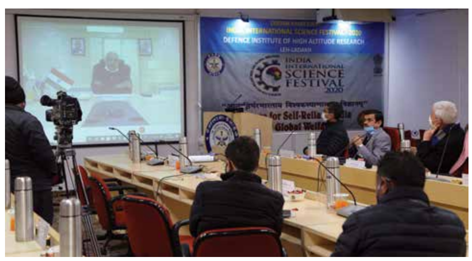
Inaugural Session of the curtain raiser event of IISF-2020

The IISF 2020 is the sixth of the series, organized continuously since