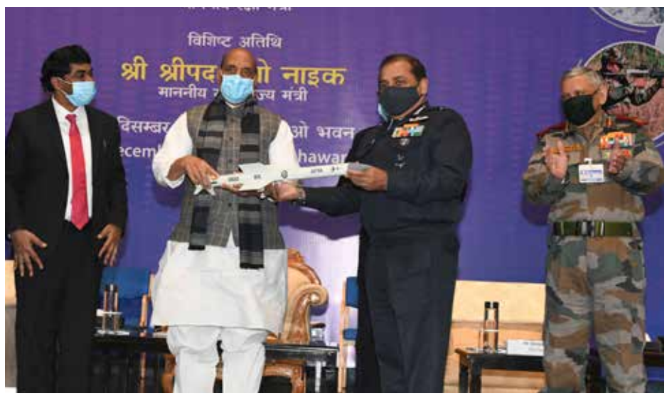
Hon'ble RM handing over Astra Mk-I to ACM Rakesh Kumar Singh Bhadauria

electronic surveillance system successfully designed and developed by Instruments Research & Development Establishment (IRDE), Dehradun. The system has been deployed at Ladakh border area for day and night surveillance. The system facilitates monitoring and surveillance by automatically detecting the intrusions in harsh high