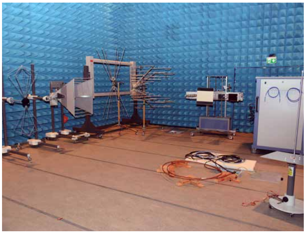
RF shielded Semi-Anechoic Chamber of the EMI/EMC Test Facility

and accessories for EUT of size 1 x 1 \times 1 m<sup>3</sup>.