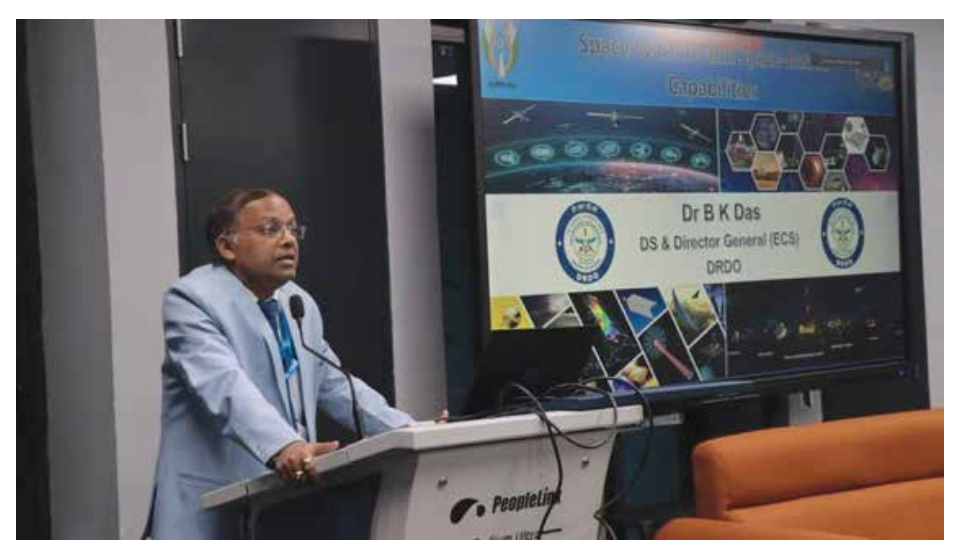
Dr BK Das, DS & DG (ECS) during Workshop on Space Warfare and Space-Based Capabilities, at Hyderabad, on 22 September 2023