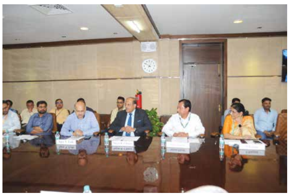
Battle Scenario 2047-Unconventional Threats and Asymmetric Warfare, at MP-IDSA Delhi, on 12 October, 2023