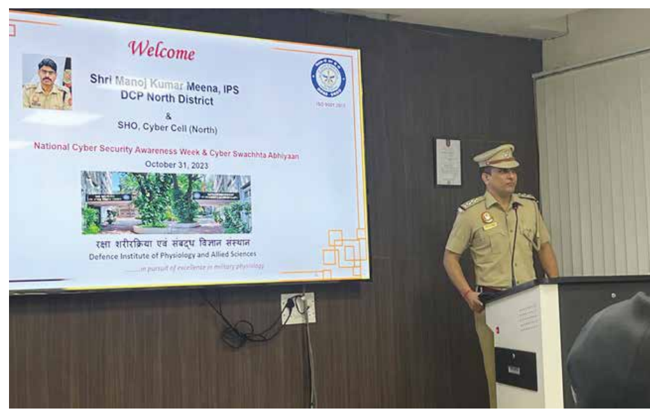
Cyber Swachhata Diwas Samaroh at DIPAS, Delhi

DIPAS participated in the pledge event. A lecture was also organised to celebrate the Cyber Swachhata Abhiyaan: Cyber Hygiene Campaign on 31 October 2023, to increase awareness at the mass