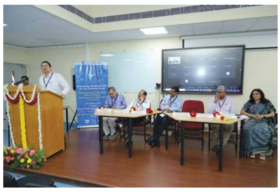
Defence Advanced Materials, Manufacturing Technologies, and 3D Printing, at DIA-RCoE, IIT-Madras on 14 October 2023

Discussions encompassed rocket propulsion, aero engine propulsion, hypersonic propulsion, electric propulsion, green propulsion, and innovations in propulsion materials. The workshop delved into advanced propulsion for deep space missions, highlighting the role of AI and autonomous systems. Bio-inspired propulsion methods were also explored, emphasizing