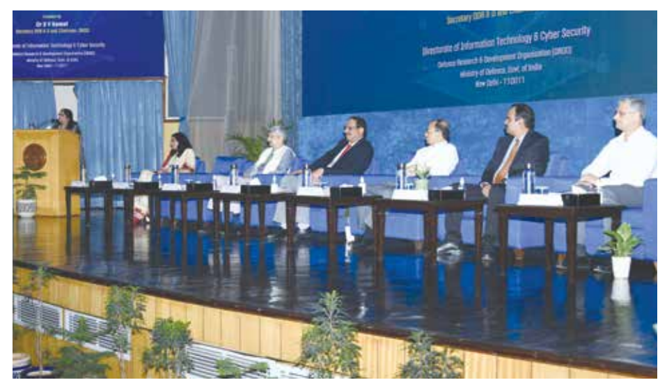
Cyber Swachhata Diwas Samaroh at DRDO HOrs. New Delhi

Defence Research and Development Organizations (DRDO), HQrs, Delhi, organized the Cyber Swachhata Diwas Samaroh on 25 October 2023 during the celebration of Cyber Swachhata Week (23-27 Oct 2023). The event was part of the cyber hygiene campaign to increase awareness at the mass level, which was coordinated by the office of the National Cyber Security Coordinator under the National Security Council Secretariat, Govt. of India. The event, held at DRDO Bhawan, Delhi, brought together