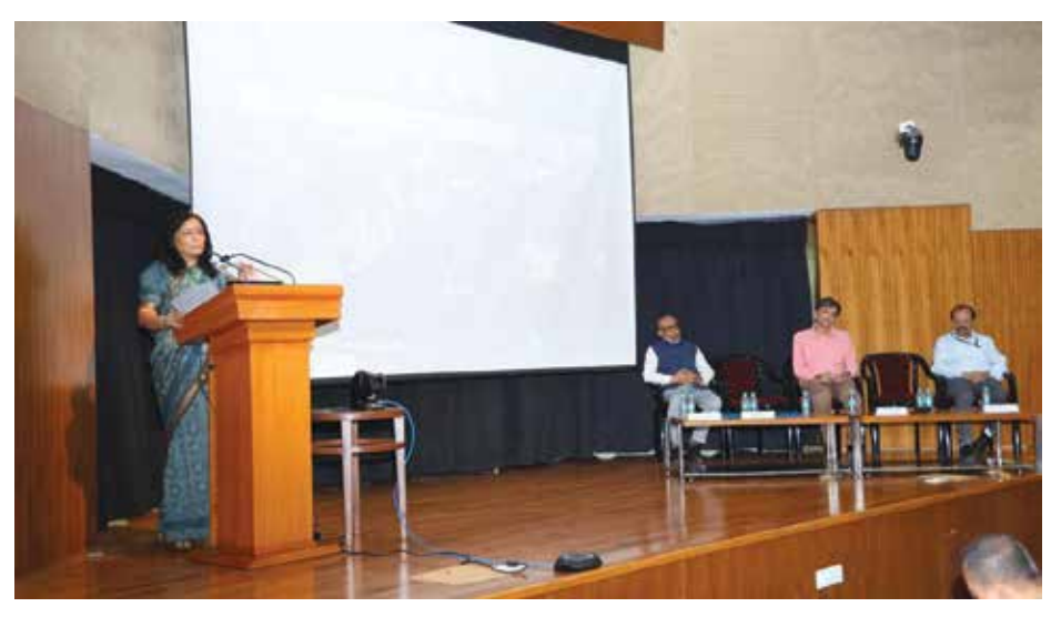
Advanced Sensors and Imaging, at IIT Delhi, on 6 September 2023

The workshop also addressed space mining, space iunk utilization, intelligent debris management, self-healing electronics technology, and innovative energy solutions beyond Li-ion batteries, signalling a forward-looking approach to space-based challenges.