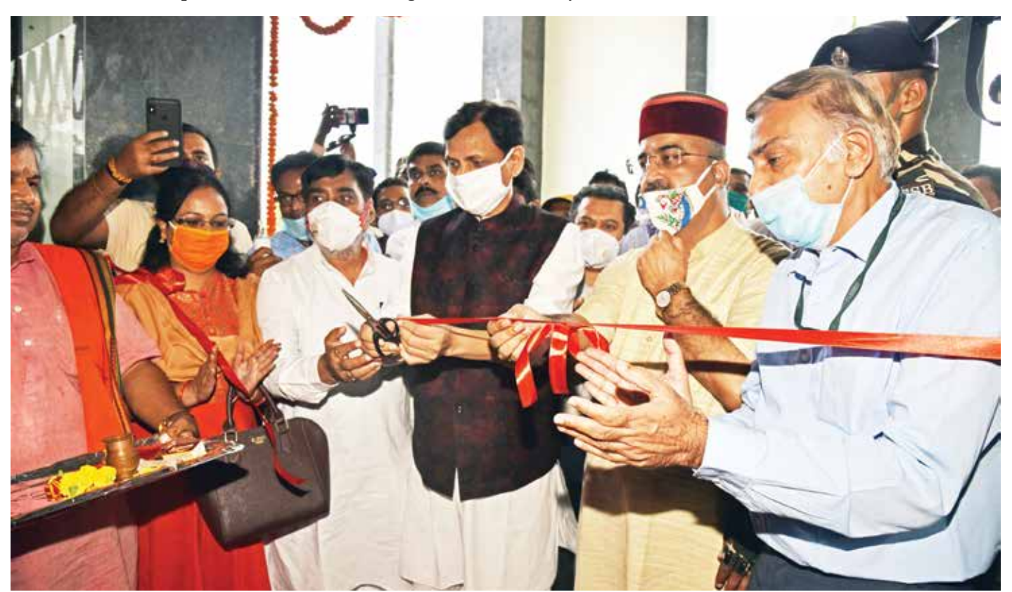
Shri Nityanand Rai, Hon'ble Union Minister of State for Home Affairs inaugurating DRDO's 500-bed Covid Hospital in Bihta, Bihar

Doctors, nurses, and other supporting medical staff, etc., for the hospital have been arranged by the Directorate General Armed Forces Medical Services (DGAFMS). Bihar Government will provide free of cost facilities such as 2 lakh lt of water per day, 6 MVA electric supply and security arrangements for the hospital.