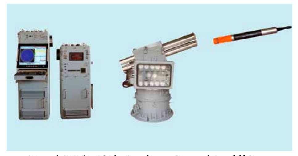
Maareech ATDS (L to R): Fire Control System, Decoy and Expendable Decoy

detection and decoying capabilities superior to that of global systems. Also, being totally indigenous, continuous support of DRDO and Indian industry is available for up gradation of capabilities based on new requirements arising out of tactical missions.