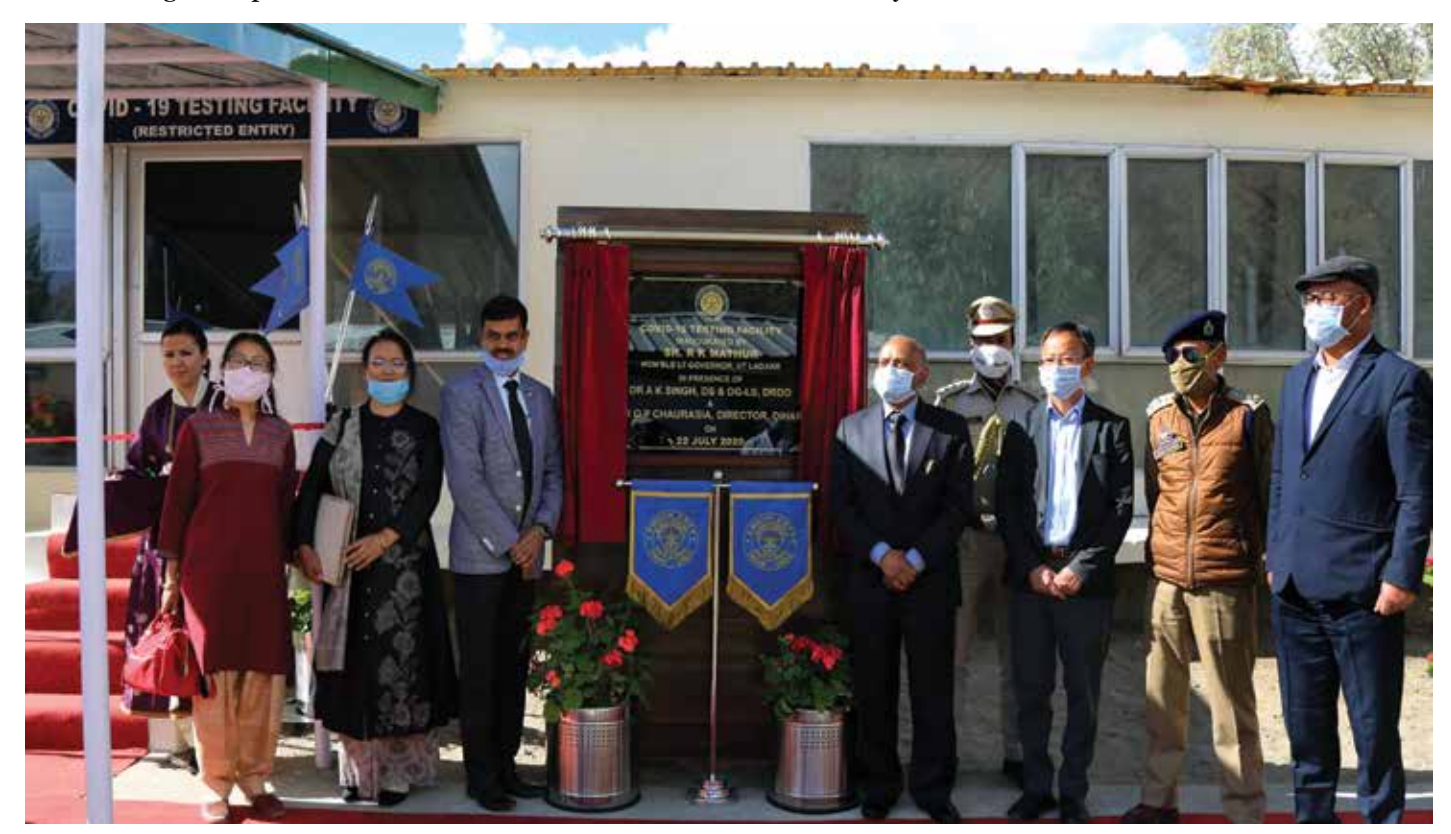
Inauguration of Covid Testing Lab at DIBER Leh

DIHAR is one of the life sciences laboratories of DRDO working on cold arid agro-animal technologies. The laboratory is screening and identifying the medicinal and aromatic plants to exploit them for use for defence purposes and also on greenhouse technologies for high altitude and cold desert areas.