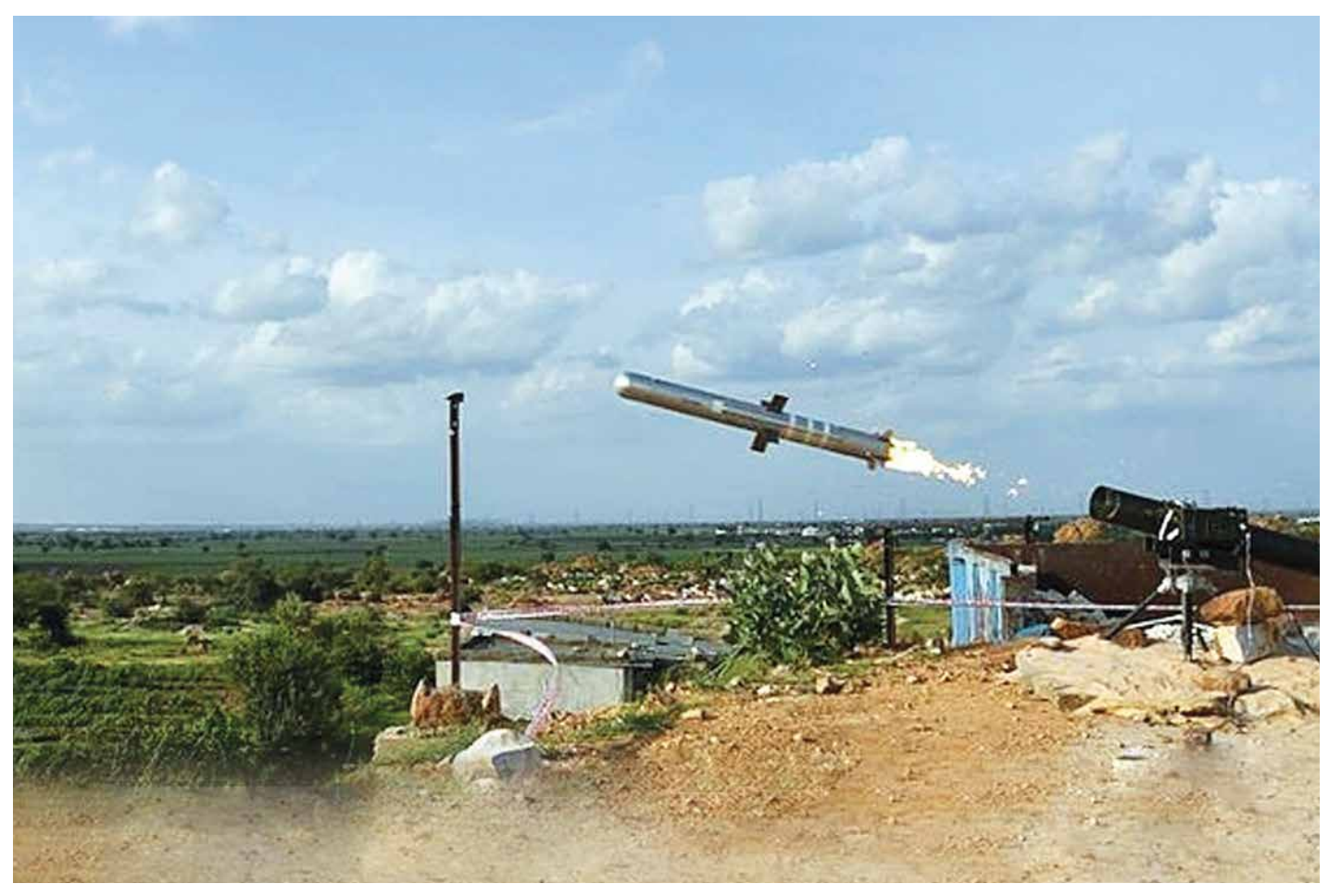
Anti-tank Guided Missile Dhruvastra

Extreme precautionary measures such as social distancing, sanitization of all facilities, use of masks and sanitizers, shield and Personal Protective Suits were taken during the testing.