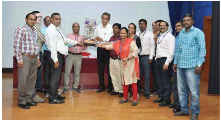
National Safety Week Prize distribution ceremony at HEMRL