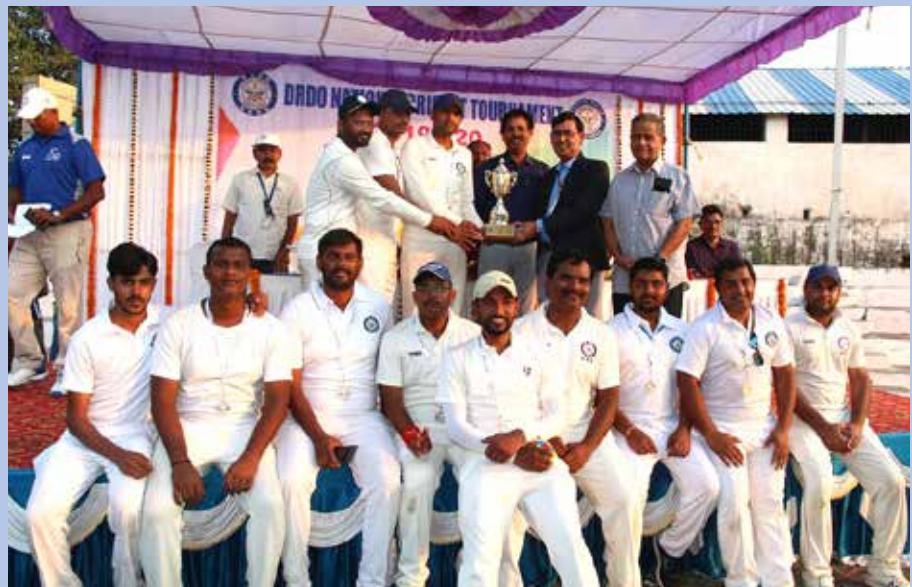
Team Central Zone with Tournament Trophy