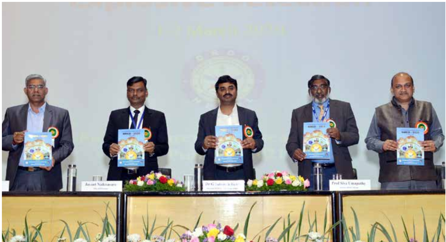
Release of NWED Souvenir

and there is a need to develop rapid, sensitive and reliable methods for explosive detection. He brought out that the commercially available explosive detection devices works within specific limitations in terms of domain of explosives and pointed out that most of these works at a close proximity with the explosives. He stressed that it is utmost necessary to interact with the security agencies and end users to understand their specific requirements and develop reliable detection devices specific to particular applications. He also stressed about the need of test protocols and certifying agency for evaluating various explosive detection devices keeping in view the requirements of