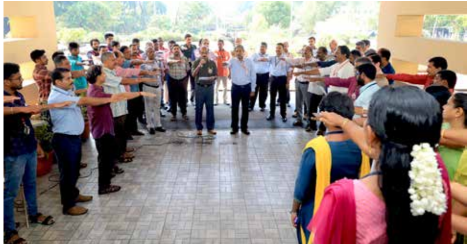
NPOL fraternity taking Safety Pledge

On the concluding day of the celebration, Shri GS Radhakrishnan