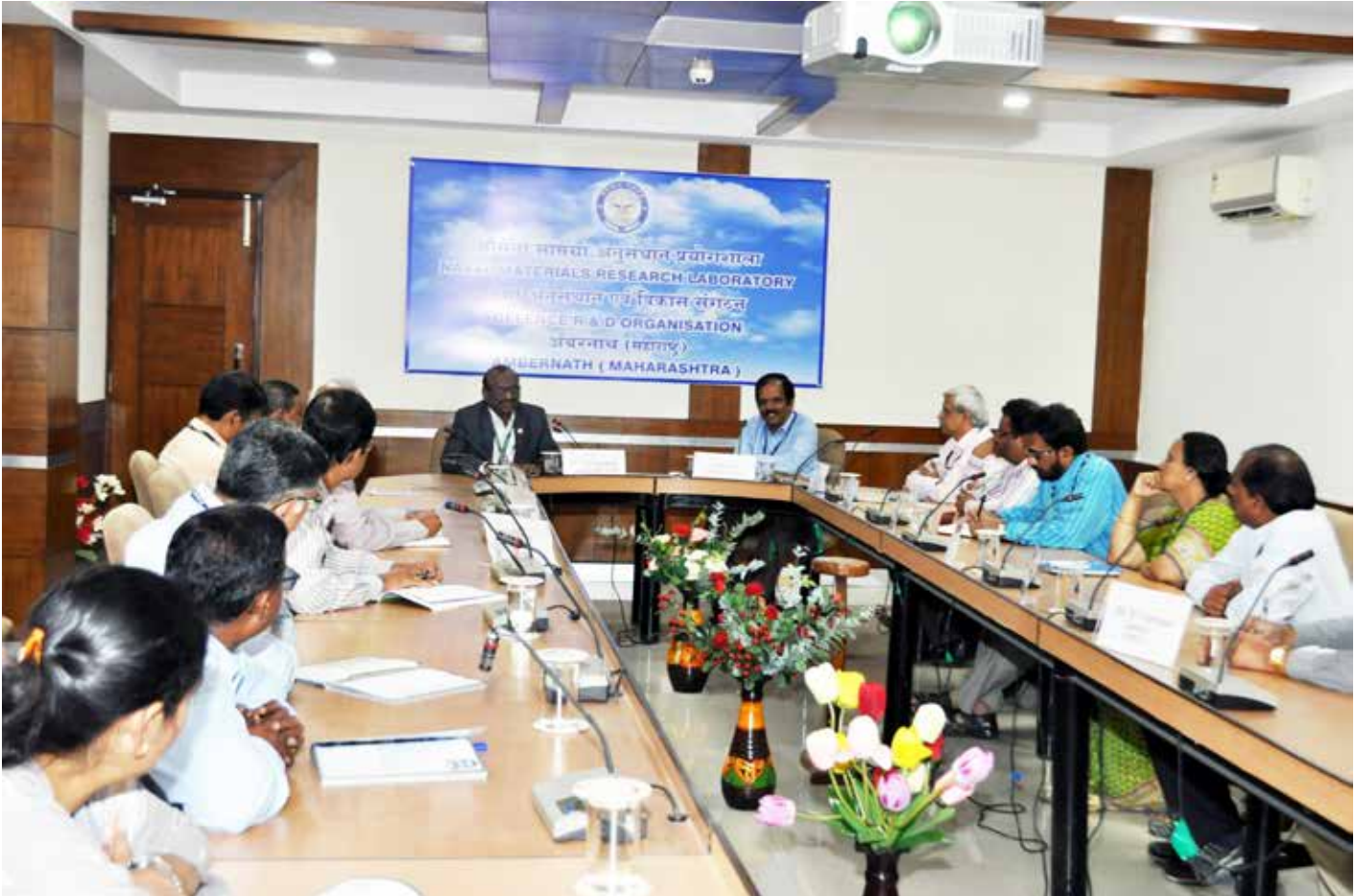
DS & DG (PC & SI) with Director, NMRL & senior Scientists