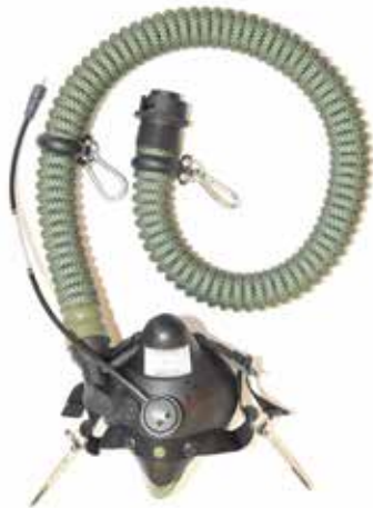
Pressure Breathing Oxygen Mask for pilots operating Su-30, BISON, MiG 29, BISON and Mirage aircraft

for Military Airworthiness (A/C), Director General Air Quality Assurance (DGAQA), Institute of Aerospace Medicine (IAM), Aircraft and Systems Testing Establishment (ASTE) and development partners from industries M/s Shakti Enterprises and M/s Vega Aviation participated in the successfully