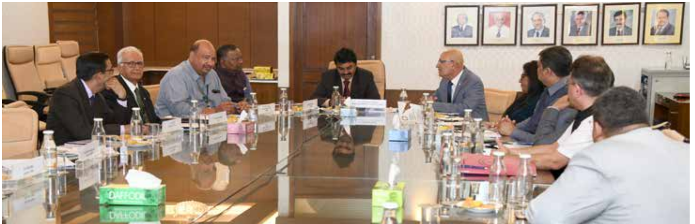
Signing of MoU between IDST DRDO and Govt of Gujarat at DRDO HQ