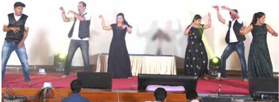
R&DE (E) employees performing dance at lab Raising Day