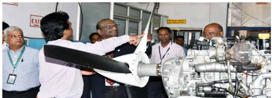
DG (PC&SI) being briefed about 65 HP Rotary Engine to