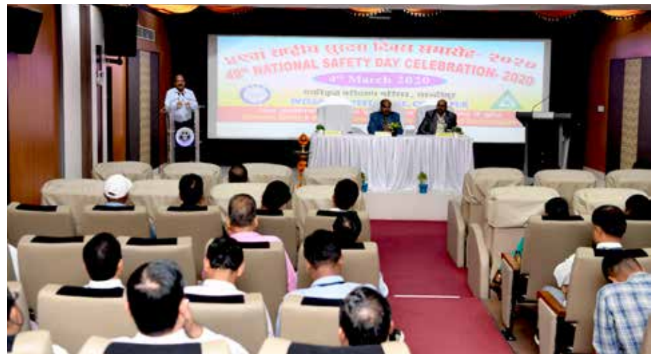
National Safety Week celebration at ITR

keynote address on the theme "Enhance Safety & Health Performance by use of Advanced Technologies."