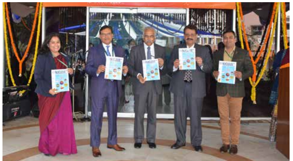
Release of in-house Publication of INMAS

area of Radiation Biology and training to military and paramilitary forces in the field of CBRN Defence. He urged INMAS for using its skill and expertise to do high-end research and focus on deliverables/products in areas of focus. The Chief Guest presented DRDO Lab-level awards and cash awards to meritorious employees of INMAS for their outstanding contributions. The dignitaries released in-house INMAS publication for the year 2019. A colourful cultural programme was presented by INMAS employees and students.