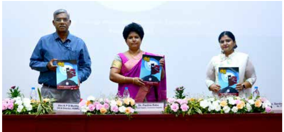
Release of HEMRL in-house magazine ‘URJA’