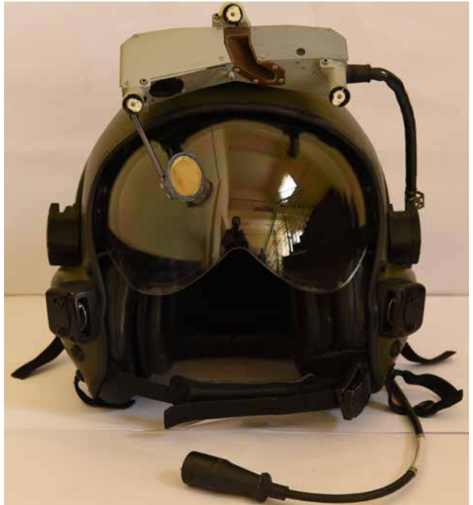
Lightweight Integrated Aircrew Helmet for Su-30, BISON, MiG 29 and Mirage aircraft with EMI/EMC complied pre-amplifier