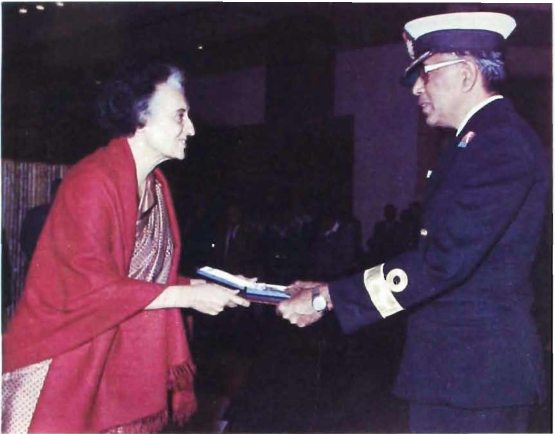
Author receiving the 'Scientist of the Year' award from the then Prime Minister Smt. Indira Gandhi - 1984.