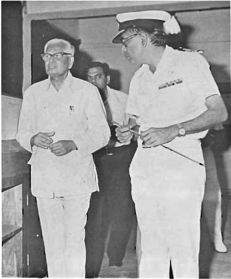
Author with Shri R Venkataraman, the then Defence Minister when he visited NSTL in the early eighties.