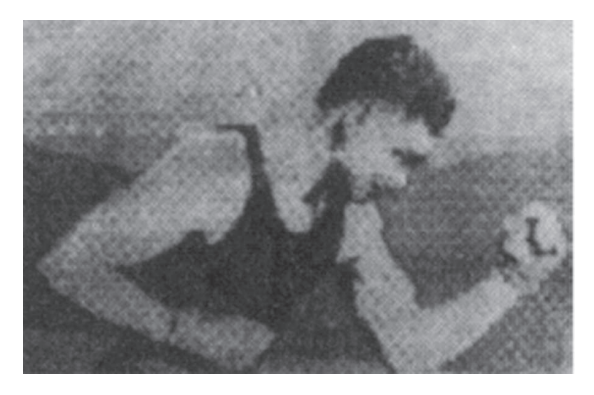
Figure 1.1. Early digital image.

Mid to late 1920s: Improvements in the Bart lane system resulted in higher quality images as: