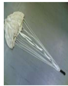
Fig: 1 st stage drogue