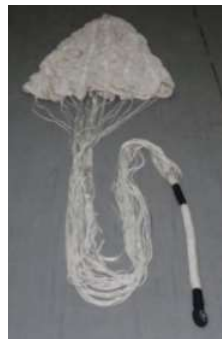
Fig: 2 nd stage drogue