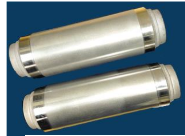
Coated Rotor Shaft