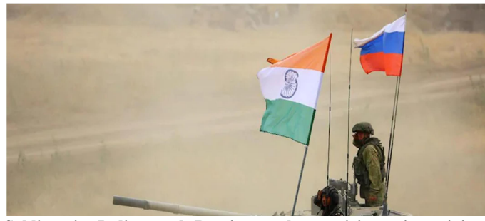
Soldiers in Indian and Russian tanks participate in a joint-military drill.

Given this geo-political scenario, any hypothetical clash with Pakistan or China, or both together, will see Delhi look towards Moscow, whether it's for military resupplies or spares.