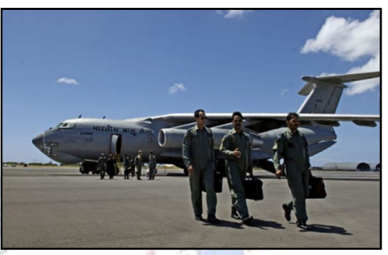
Representational image | Indian air force pilots walk away from their IL-76 medium cargo jet after landing

Sources in the defence and security establishment say that from a pure air-to-air combat, the Indians have an edge over China in the high altitude Ladakh sector.