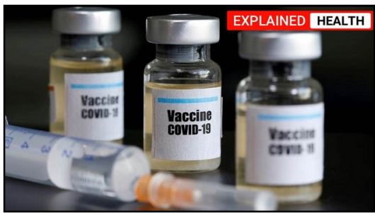
Covaxin coronavirus vaccine candidate: Bharat Biotech plans to begin its phase I and II trials in July, but is unsure of the overall timeline for testing and approving its vaccine.

As part of this collaboration, NIV isolated a strain of the virus from an asymptomatic Covid-19 patient and transferred it to BBIL early in May. The firm then used it to work on developing an "inactivated" vaccine–a vaccine that uses a the dead virus–at its high containment facility in Hyderabad.