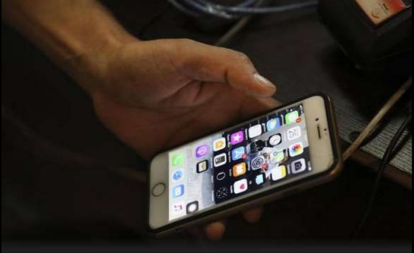
File photo for representational purpose.

"I want to stress that the Chinese government consistently asks Chinese enterprises to abide by international rules and