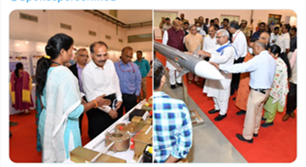
8:58 PM · Aug 30, 2022 · Twitter for iPhone