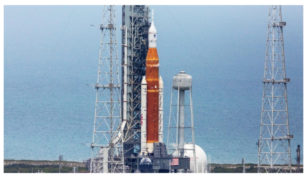
The 322-foot (98-meter) Space Launch System rocket is the most powerful ever built by Nasa.

Nasa on Monday scrubbed the launch of the Space Launch System (SLS) on the maiden Moon mission over issues with an engine that would have powered the rocket on a course to the lunar world. The clock was stopped and reset repeatedly as issues were encountered during the fueling of the rocket.