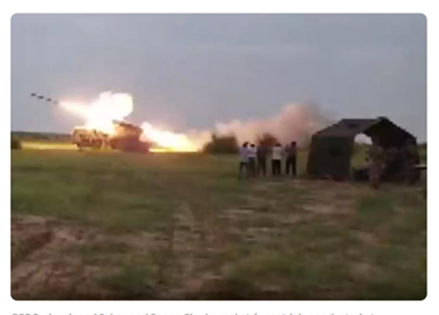
DRDO-developed Enhanced Range Pinaka rockets' user trials conducted at Balasore&Pokhran in past few weeks

Development Organization (DRDO), has successfully completed the enhanced range Pinaka rockets' user trials at Balasore and Pokhran in the past few weeks. In what is being viewed as a success for Make in India in defense, manufacturers of the system, namely, Munitions India Ltd & Economic Explosives Ltd met user requirements at trials' completion, DRDO said on Monday, ANI news agency reported.