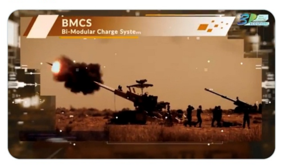
6:39 AM · Oct 13, 2022 · Twitter for iPhone