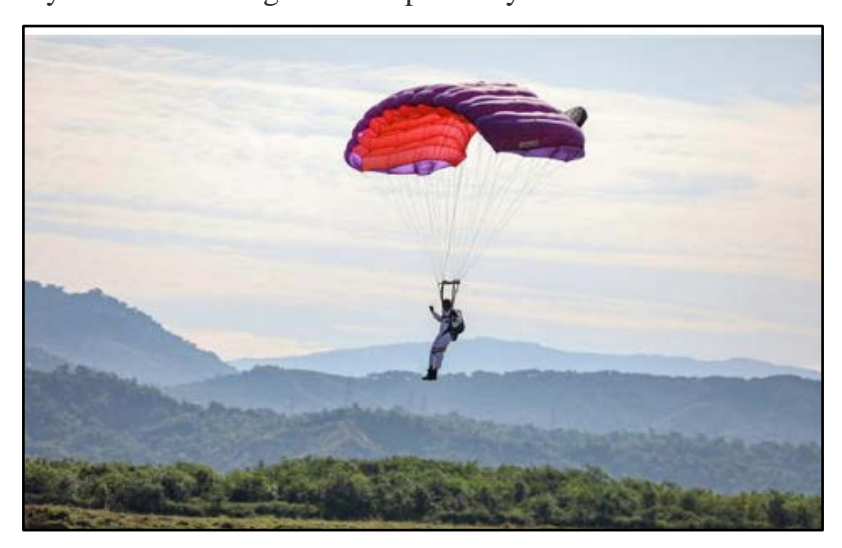
Figure 1 An IAF paratrooper performs during the diamond jubilee celebrations of the headquarters of Air Officer Commanding, Jammu, Kashmir & Ladakh, in Udhampur on Wednesday.

and other senior IAF, military and civil dignitaries also attended the show. "As part of the diamond jubilee celebrations of the headquarters, AOC, the motive is to dominate the Himalayas and that is what they have been doing it for the past 60 years.