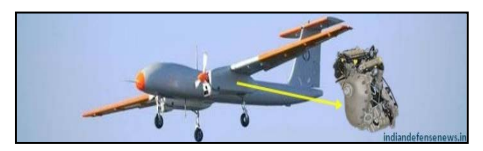
TAPAS BH-201 is currently flying with an imported AUSTRO AE300 Diesel-Kerosene Engine

DRDO scientists are working with a Coimbatore-based private firm (reportedly Tech Mahindra) on an indigenous engine for TAPAS. The drone is currently powered by the Austria-made Austro engine, which comes with twin turbochargers. As of now, close to 75 per cent of the drone is India-made. DRDO scientists claim that, once inducted, TAPAS would be almost eight times cheaper than imported drones. TAPAS-BH-201 (formerly referred to as RUSTOM-II), developed by the Bangalore-based Aeronautical Development Establishment (ADE), recently achieved an altitude of 28,000ft and 18 hours of endurance. The agency, under the DRDO, began developing the medium-altitude long-endurance (MALE) unmanned aerial vehicle a decade ago at a cost of Rs1,786 crore.