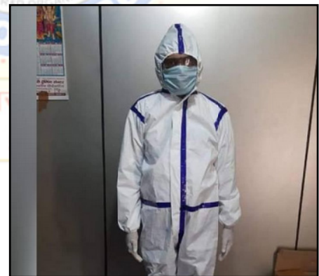
For representational purpose.

He said as the matter was widely talked about, it had created anxiety among doctors and nurses in Assam.