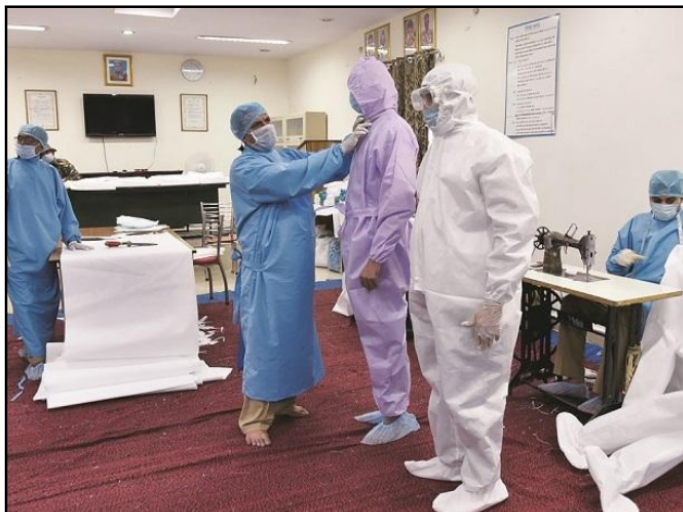
OFBs have manufactured 5,870 personal protective equipment kits

According to BEL, it will manufacture 5,000 ventilators in April, 10,000 in May, and 15,000 in June. Along with the DRDO, BEL is trying to indigenise as many ventilator components as possible.