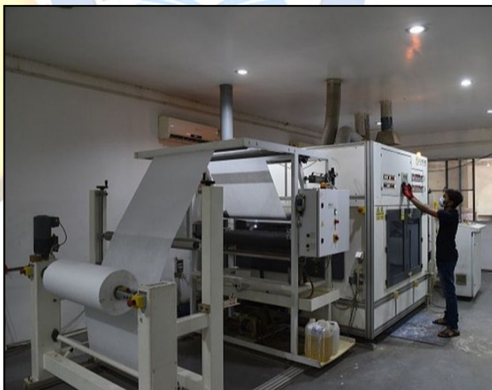
A textile engineer at Ahmedabad Textile Industry's Research Association (ATIRA) monitors an electrospinning machine, which is used to make filters for N99 masks for the Defence Research and Development Organisation (DRDO), during a government-imposed nationwide lockdown as a preventive measure against the spread of the COVID-19 coronavirus in Ahmedabad on April 17, 2020.