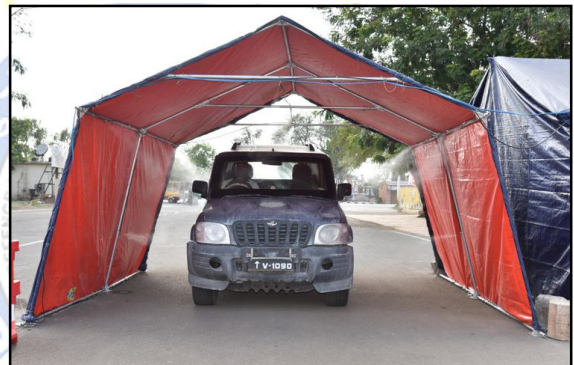
Vehicle disinfection Chamber