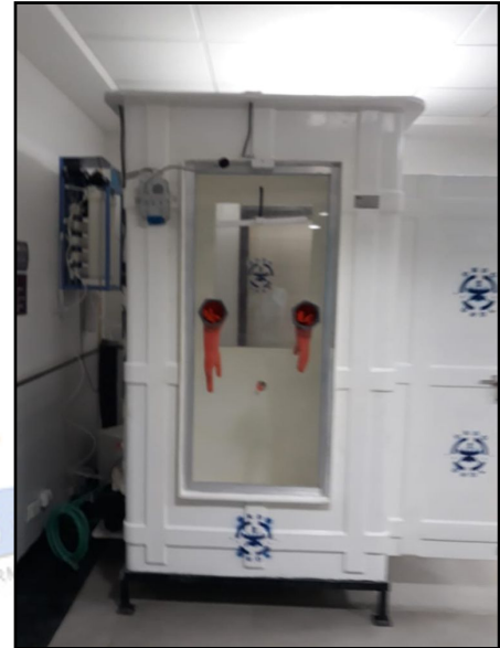
COVSACs being manufactured.

With about 58 laboratories/complexes strung across the country, DRDO is a massive science and technology organisation for defence applications, which has developed thousands of products for use by the Indian Army, the Air Force, and the Navy. Its facilities develop anything from missiles, anti-satellite launch vehicles, battle tanks, Light Combat Aircraft Tejas, nuclear-powered submarines, electronic warfare systems, radars, lasers, sonars, torpedoes, and unmanned aerial vehicles, all of which require cutting-edge technologies. The DRDO labs have developed biofuels, bio-toilets, parachutes, aerostats, flying suits and gear for jet aircraft pilots, specialised military nutrition, crops that can be cultivated at high altitudes, ready-to-eat chapattis, instant vegetable pulao, instant cholay mix, ready-to-eat potato peas curry, instant sooji halwa, instant idlis, processed coconut chutney, omelette mix powder, scrambled egg mix