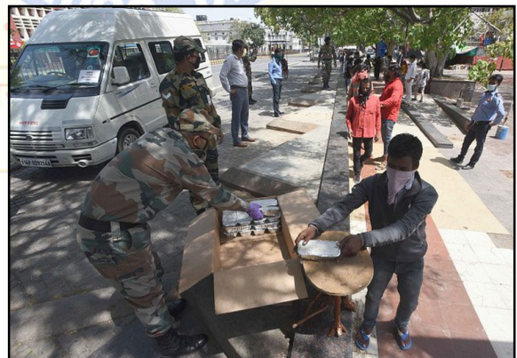
DRDO personnel distribute food at the Connaught Place Hanuman Temple, on day fourteen of the 21 day nationwide lockdown against coronavirus in New Delhi, India.