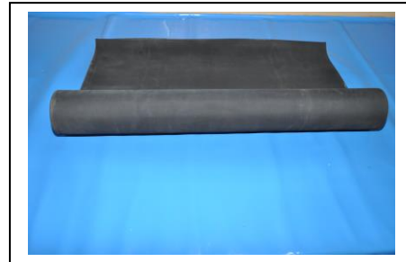
IRP 1075 Rubber Roll