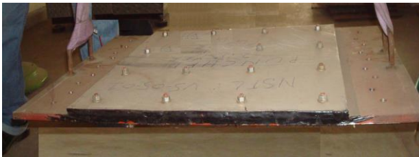
3 layer VDC applied on base structure

Vibro Damping Coating (VDC) is a multilayer sandwich structure for use in submarine decks and engine rooms for suppressing the structural vibration arising from the operation of onboard machinery. The VDC is fabricated by adhering multiple layers (typically 3 layer) of perforated rubber sheet (IRP1074) and sandwiching the multilayer rubber structure between base structure and constraining layer. The top constraining layer is applied onto the rubber layer by adhesive and the sandwich structure is bonded to the base by mechanical bolting. The perforated rubber layer is made by either punching the perforations on plane rubber sheet using a punching machine or by compressing moulding.