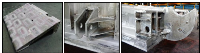
Photographs of selected parts of the bridge fabricated using the sheets and plates of the indigenized alloy in T7x51 temper.