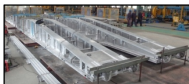
Manufacture of Sarvatra bridges