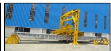
Load testing of Sarvatra Bridge