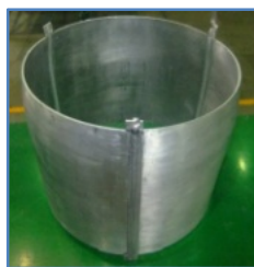
A structural part of a missile formed by forming and joining of 4 mm thick Alclad AA2219-T83 sheets. This part underwent successful structural tests.