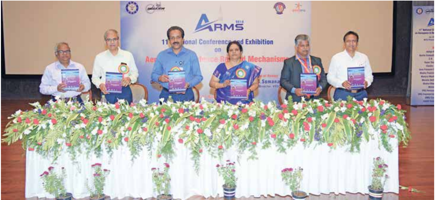
Release of Conference Proceedings