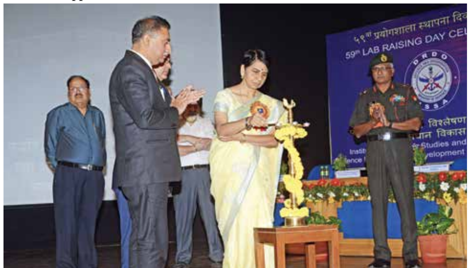
Inauguration of ISSA Raising Day

Formal handing over of, "Systems Analysis Study of Long Range Vector Against Land Targets (BRAHMOS)" to Artillery Directorate, Indian Army and "Air Defence Asset Planning Tool (ADAPT)" to Indian Air Force were carried out.