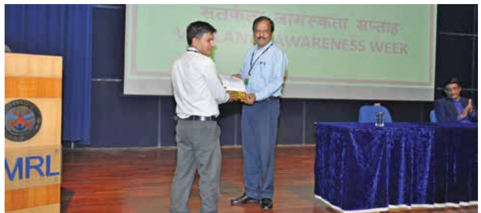
Vigilance awareness week at NMRL