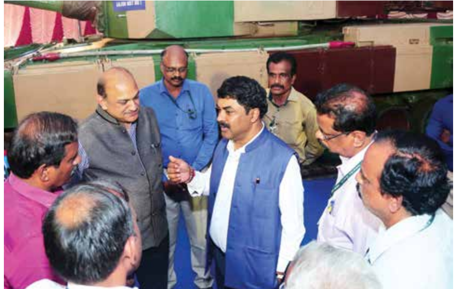
Dr G Satheesh Reddy, Chairman DRDO at CVRDE