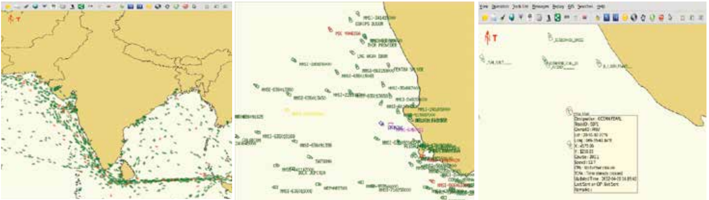
L-R: Common Operational Picture of Indian Coastline; Ships are colour coded based on the country they are registered with; Detail information of merchant vessel

(COP) displays position of Indian Navy war ships and is used for monitoring of merchant ships (Indian as well as foreign origin), foreign war ships, aircraft and sub-surface tracks with detailed information regarding voyage data. It facilitates the end user to assess the battlefield situation with better appreciation of the operational scenario and enables the commanders for informed decision making. It also provides tools and utilities to facilitate data analysis, tactical operations and naval exercises. System has DSS tools to detect anomalies and irregularities based on the user defined validation criteria and to highlight the same to the user with effective and timely action. The solution provided also caters for communication security and information security in locations where MDA nodes are deployed.