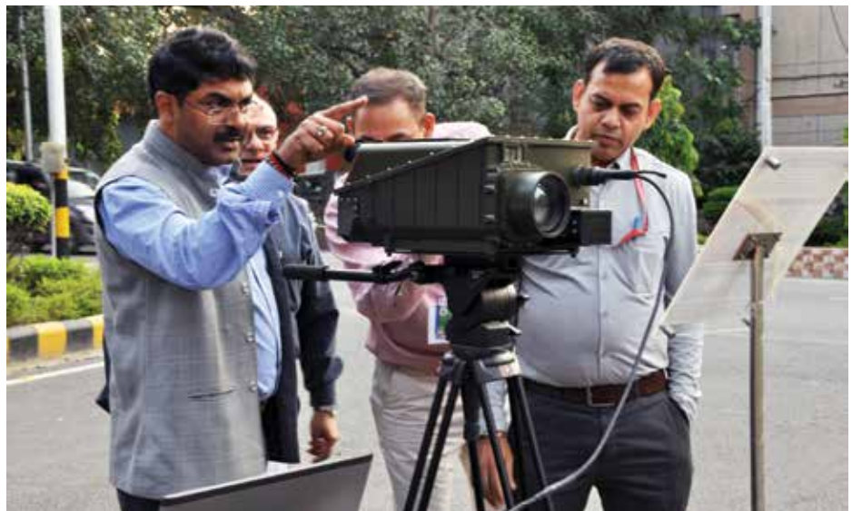
Chairman DRDO being briefed about LASTEC product