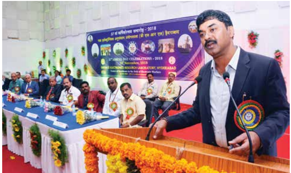
Dr G Satheesh Reddy speaking on the occasion of DLRL Raising Day

Lab-level DRDO Awards were conferred upon the meritorious employees and merit-cum-means scholarships were distributed. Employees who completed 20 years of service were honoured with mementos.