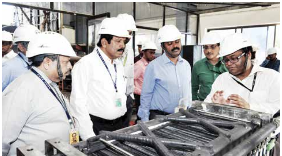
Chairman DRDO being briefed about NMRL research activity