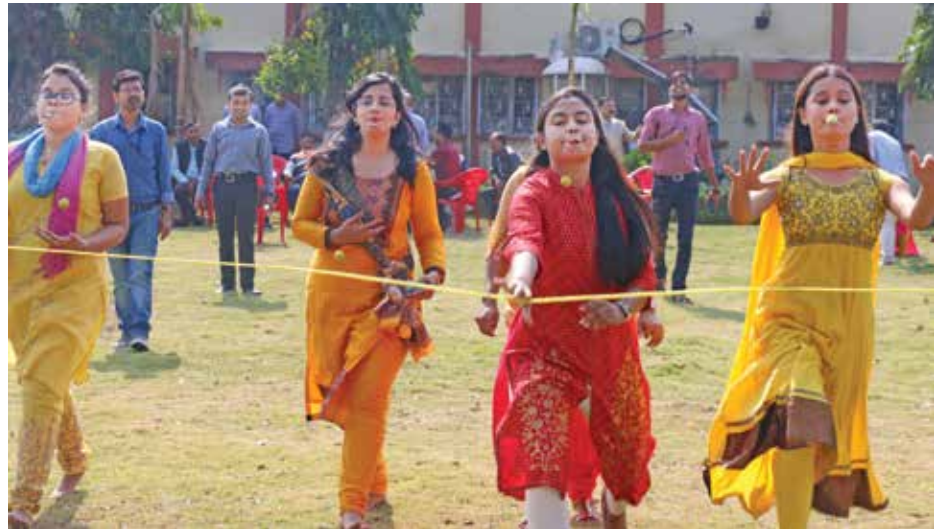
Spoon race at DRL Raising Day Celebration