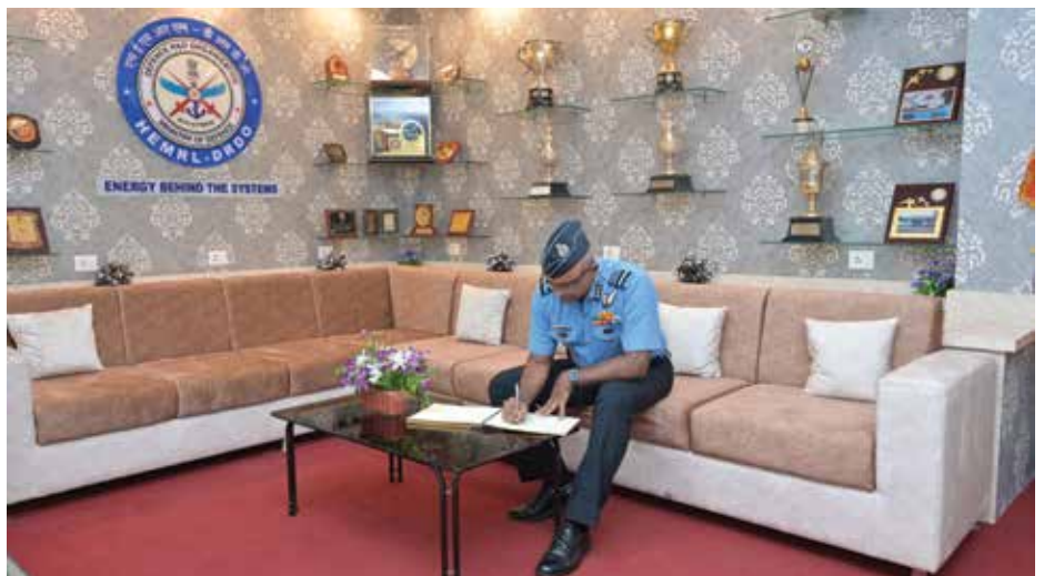
A moment during the visit of Air Mshl CR Mohan, AVSM VSM, SMSO HQ MC, IAF on 18 August 2022 to HEMRL, Pune