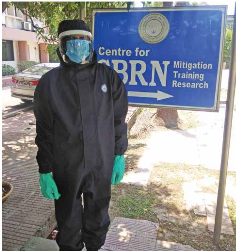
Protecton™ Biosuit and Mask

other countries especially SAARC, BRICS association)