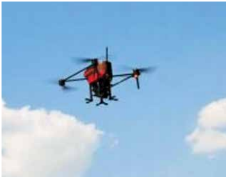
UAV-base surveillance system

agencies fighting battle against the global pandemic.