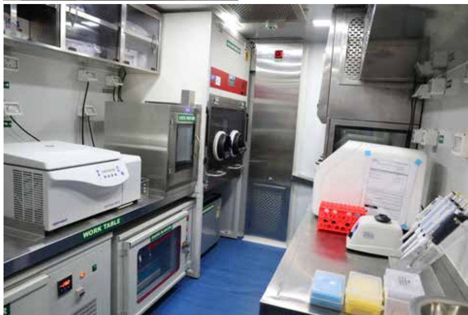
Clockwise from top left: Entrance and first air lock room with sterile PPE, gloves and mask storage; Second airlock with PPE change, emergency shower and eye wash and used PPE disposal facility; Interior view of the lab showing Class III biosafety cabinet, real time PCR, PCR work station, pass box, -20 °C freezer, refrigerator and incubator

Further provision for storing and donning PPE, storage for autoclave and dynamic pass box facility have been provided for sample entry used aprons, emergency body shower and eye wash, etc., have been provided.