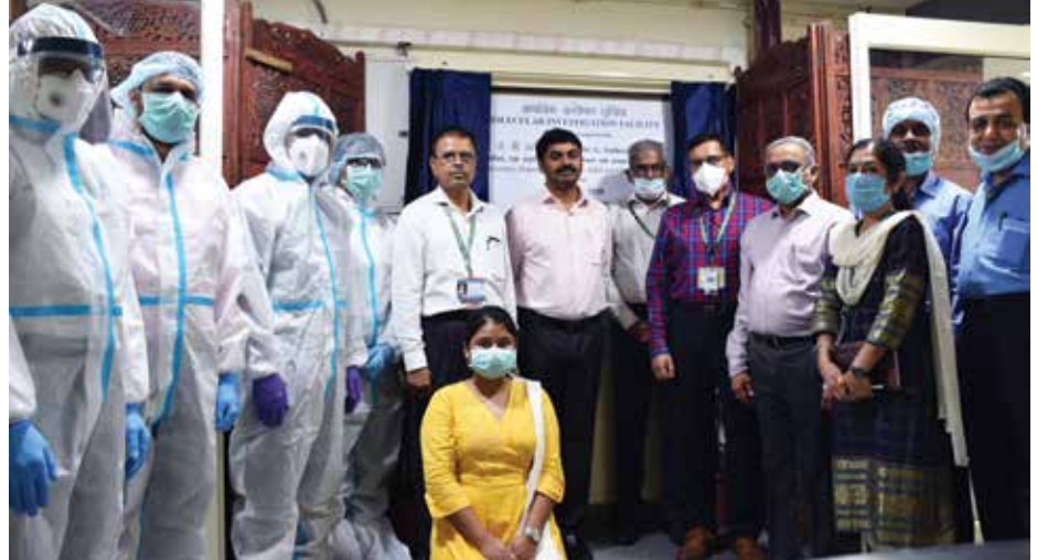
Inauguration of Molecular Investigation Facility at DIPAS

Dr Himanta Biswa Sarma, Hon'ble Minister, Health and Family Welfare, Govt of Assam, inaugurated a well-