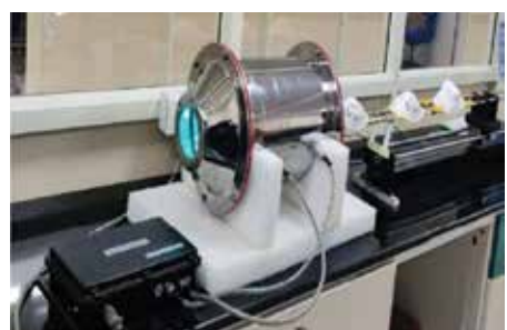
Automated Mask Decontamination System

An Automated System for Decontamination of face masks has been developed based on ultraviolet (UV-C) germicidal irradiation for killing the bacteria and virus. The system comprises two sub-systems; the Air Sterilization Unit (ASU) and the Automated Feeder for supplying face masks configured as per time required for sterilization of every mask. Very high intensity radiation is achieved inside the ASU to the tune of 69.07 J/s/cm 2 that ensures the high Sterility Assurance Level (SAL). Further studies are being carried out in Bio Safety Cabinet (BSC) class II-b in a contained environment.