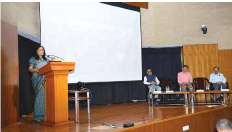
Advanced Sensors and Imaging, at IIT Delhi, on 6 September 2023

The workshop also addressed space mining, space junk utilization, intelligent debris management, self-healing electronics technology, and innovative energy solutions beyond Li-ion batteries, signalling a forward-looking approach to space-based challenges.