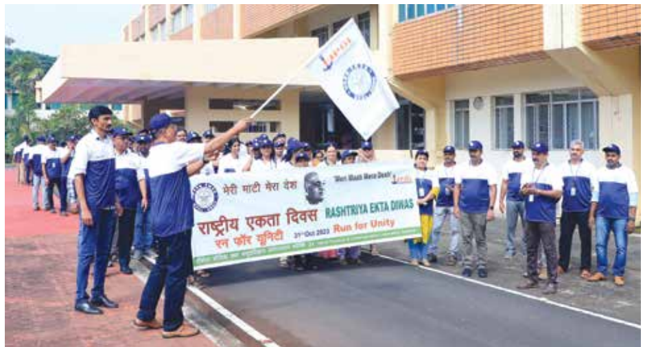
Run for Unity at NPOL, Kochi

A mass 'Run for Unity' was conducted after the pledge. Director, NPOL, flagged off the run.