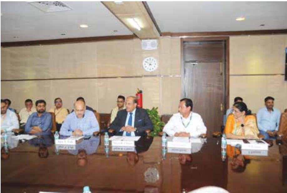
Battle Scenario 2047-Unconventional Threats and Asymmetric Warfare, at MP-IDSA Delhi, on 12 October, 2023