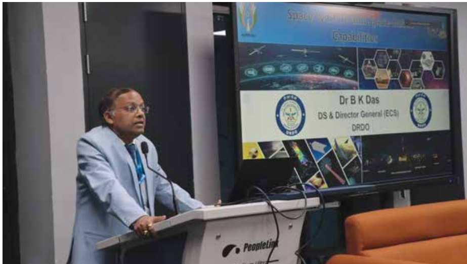
Dr BK Das, DS & DG (ECS) during Workshop on Space Warfare and Space-Based Capabilities, at Hyderabad, on 22 September 2023