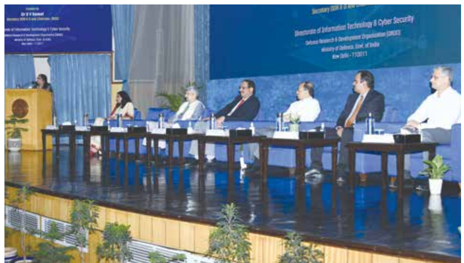
Cyber Swachhata Diwas Samaroh at DRDO HQrs, New Delhi

Defence Research and Development Organizations (DRDO), HQrs, Delhi, organized the Cyber Swachhata Diwas Samaroh on 25 October 2023 during the celebration of Cyber Swachhata Week (23-27 Oct 2023). The event was part of the cyber hygiene campaign to increase awareness at the mass level, which was coordinated by the office of the National Cyber Security Coordinator under the National Security Council Secretariat, Govt. of India. The event, held at DRDO Bhawan, Delhi, brought together