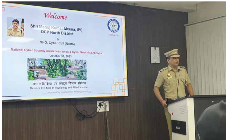
Cyber Swachhata Diwas Samaroh at DIPAS, Delhi