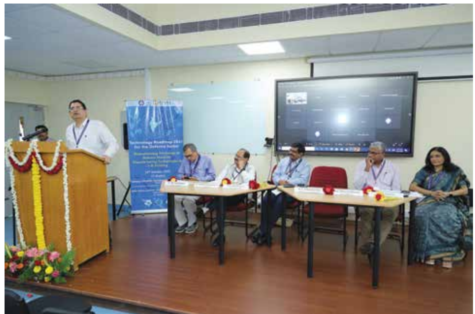
Defence Advanced Materials, Manufacturing Technologies, and 3D Printing, at DIA-RCoE, IIT-Madras on 14 October 2023

Discussions encompassed rocket propulsion, aero engine propulsion, hypersonic propulsion, electric propulsion, green propulsion, and innovations in propulsion materials. The workshop delved into advanced propulsion for deep space missions, highlighting the role of AI and autonomous systems. Bio-inspired propulsion methods were also explored, emphasizing