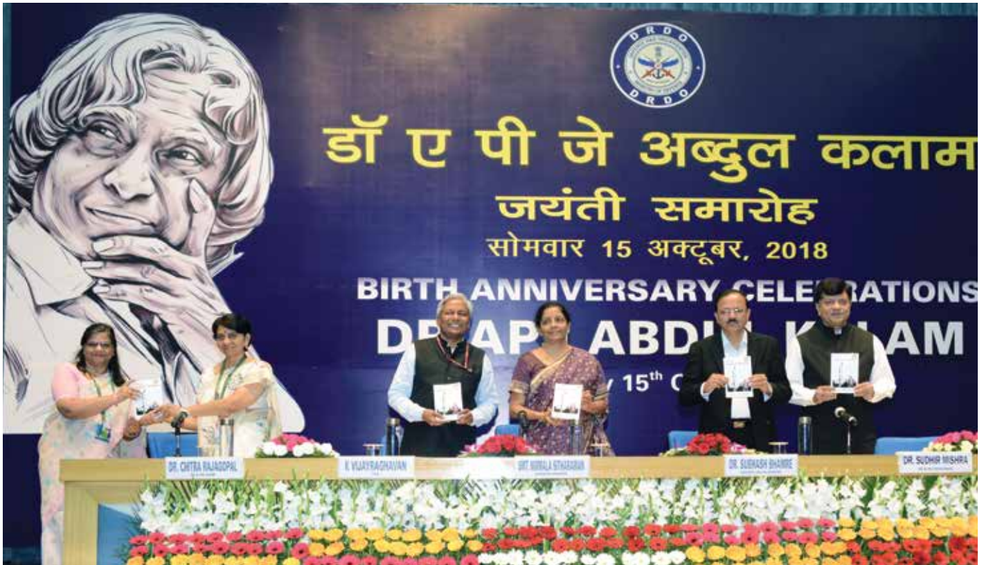
Hon'ble Raksha Mantri releasing memoirs Incredible Kalam

Students of three Delhi-based schools attended the function. These schools have set up Atal Tinkering Lab in their schools under Atal Innovation Mission of Government of India. Students from IIT Delhi also attended the function. The aim of inviting young minds was to motivate them with diverse and great qualities of Dr Kalam.