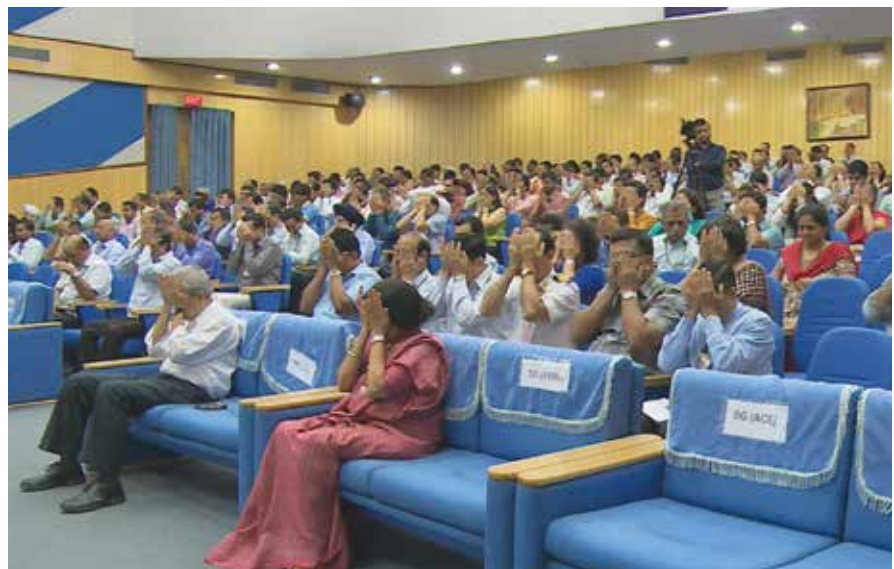
Senior scientists and staff of DRDO participated enthusiastically in Yogic kriyas

science and physiology behind the yoga and described it as the oldest Made in India product, which is now being understood in term of men to molecule because of advancement in technology.